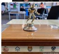
Boys 1st XV team took on Tawa College for the Beard Trophy on Weds 25 June