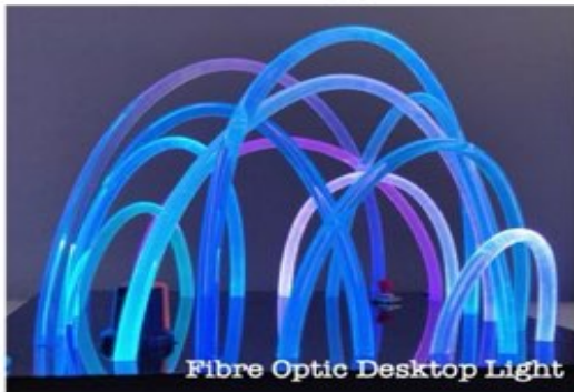
Fibre Optic Desktop Light