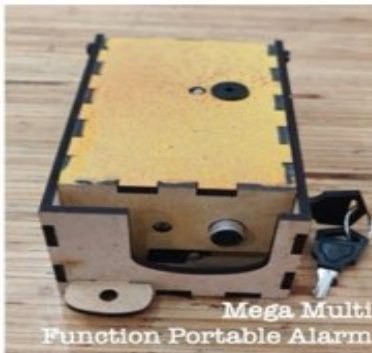
Mega Multi Function Portable Alarm