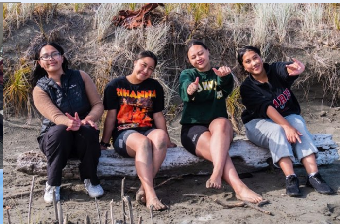
BREAKFAST CLUB (TUESDAYS AND THURSDAYS)